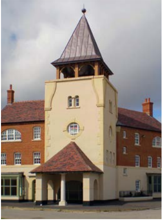
The Whistling Witch