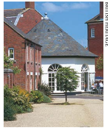
The Octagon Café