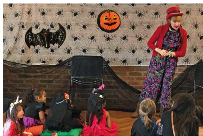
The Suburb young mesmerised with tales of Hallowe'en.